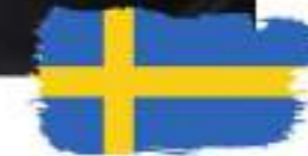
F redrik Reinfeldt The Longest-Serving Prime Minister in the History of Sweden

Former Prime Minister of Sweden During his time as Prime Minister, Reinfeldt reformed the Swedish economy and labor market, making Sweden one of the most competitive countries in Europe. More than 300,000 new jobs were created despite the financial crisis. The Swedish economy had higher growth rates and sounder public finances than many other European countries during his time in office. Having been a member of the European Council for 8 years and its President for six months, he has an extensive international network. In February 2016 Mr Reinfeldt was elected as chair to the Extractive Industries Transparency Initiative (EITI). In March 2016 Mr Reinfeldt was appointed as Senior Advisor to Bank of America Merrill Lynch.