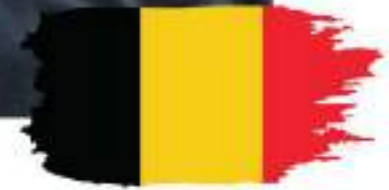
G uy Verhofstadt 47 th Prime Minister of Belgium!

Guy Verhofstadt quickly rose through the ranks of Belgian politics, becoming party president in 1982 at the age of 29. By 1985 he was Deputy Prime Minister. Between 1999-2008, he served as Prime Minister of Belgium. After he left office, he became a member of the 'Renew Europe' group in the European Parliament. Guy Verhofstadt still serves in the European Parliament today, where he is a champion of more European integration to tackle the multiple crises the EU faces for the moment. His latest book is entitled "Europe's Last Chance". Guy was awarded the Vision for Europe Award in 2002 due to his incredible work towards a more unified Europe. He was named the representative for the European Parliament in regards to matters surrounding Brexit and has regularly focused on the UK and British citizens rights within the European Union.