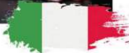
M atteo Renzi Youngest Prime Minister of Italy!

Renzi is the youngest person to serve as Italian Prime Minister and was the youngest leader in the G7. He was also the first serving Mayor to become Prime Minister. In 2014, the American magazine Fortune ranked Renzi as the third most influential person under 40 in the world, and Foreign Policy listed him as one of the Top 100 Global Thinkers. Moreover, Renzi is nicknamed il Rottamatore (the Scrapper) due to his ambition of renovating the Italian political establishment. Renzi, who did not hold a seat in either house of Parliament during his tenure as Prime Minister, became a member of the Senate as a result of the 2018 general election.